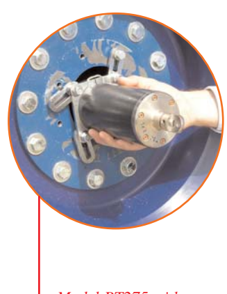
Model PT275 with universal mount