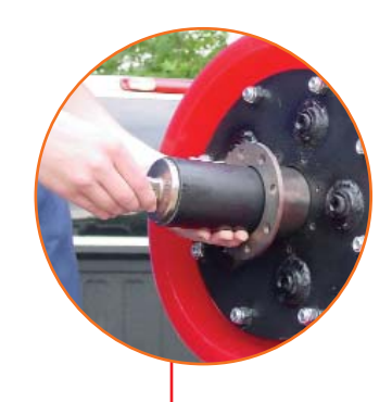
Model PT750 with regular mount